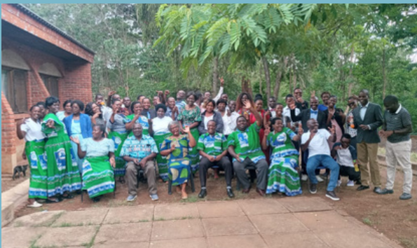
Bible Reading Promoters after Training

Currently, SU Malawi is to discuss with Presidential Advisor on Religious affairs on possible ways of making SU resources available to government departments.