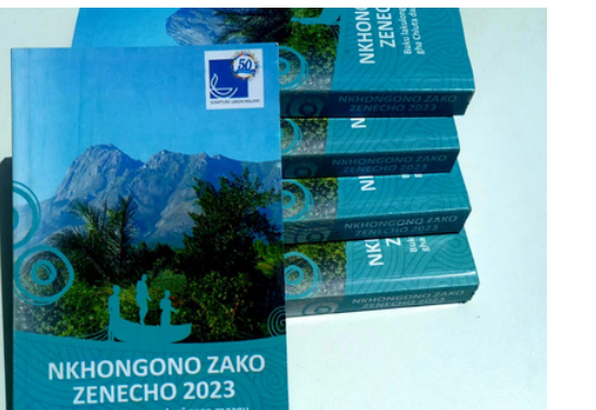
To be promoted: Nkhongono zako Zenecho

Presbyterian Church in Ireland (PCI) has pumped in £5,000 to SU Malawi to be used for training writers of vernacular (Chichewa and chitumbuka) reading notes and for promoting Nkhongono zako zenecho.