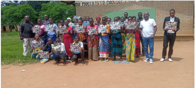
Sunday School Training at Waliranji-Mchinji