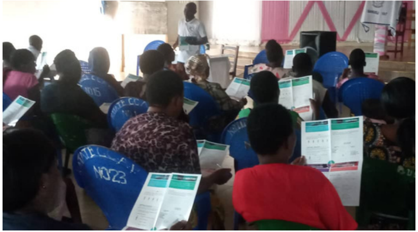
BRP Training at Katate CCAP

SU Malawi had been able to reach 20 churches in January in Central Division alone. Area 18 Assemblies of God (Dunamis Worship Centre) is one of the churches that gave special offerings towards SU work.