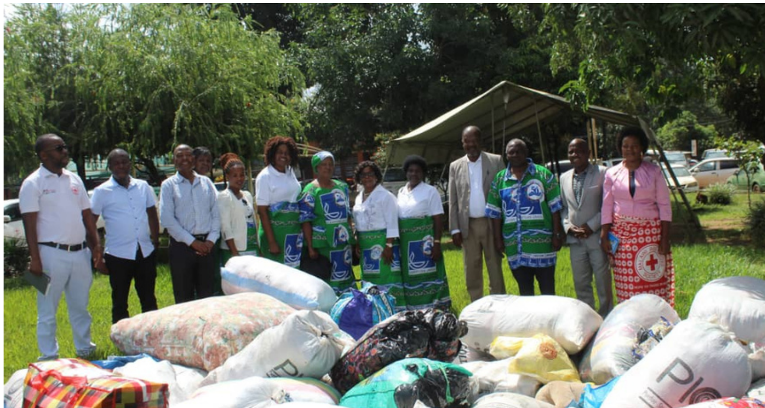
MRCs staff pose with SU Team with the assorted items that were donated