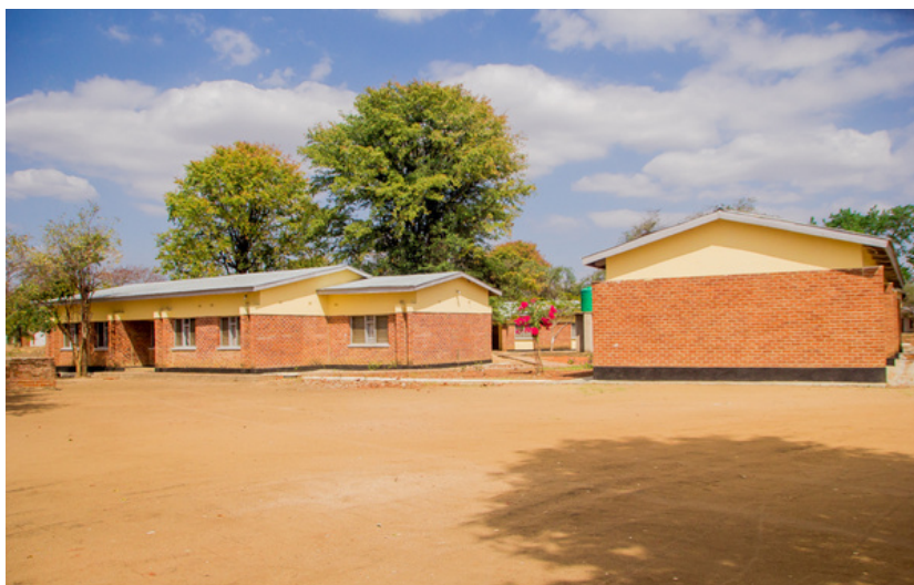
Hanger's Youth Centre in Liwonde